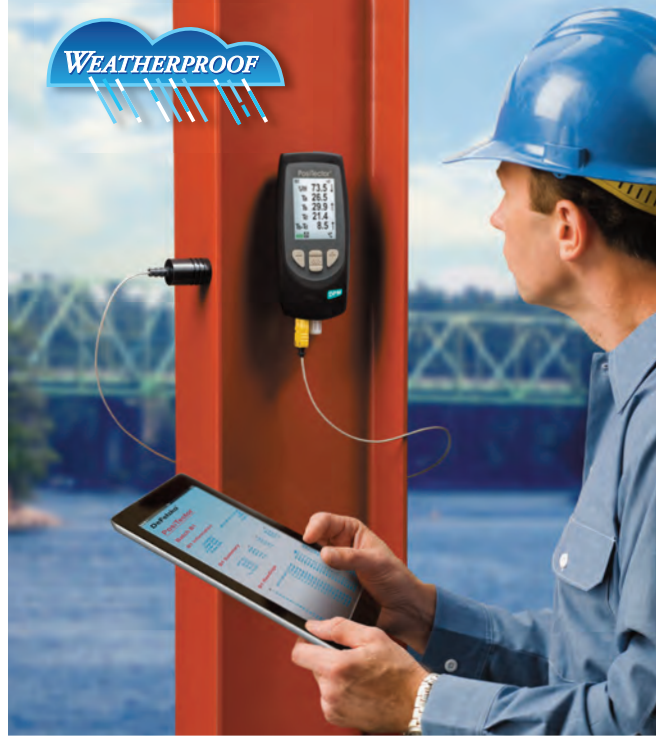
Analyze uploaded readings using a web browser from anywhere – jobsite or head office.