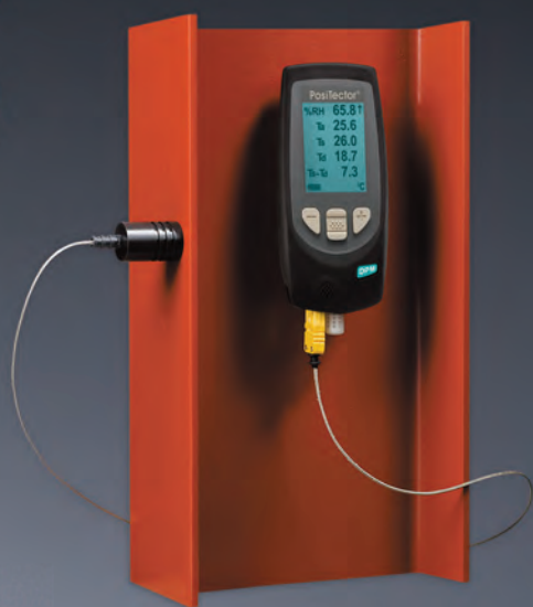
Standard model shown with separate probe

Relative humidity, air temperature, surface temperature, dew point temperature and difference between surface and dew point temperatures. Ideal for surface preparation as required by ISO 8502-4.